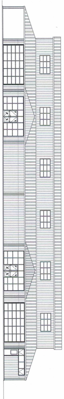
1 A2 1/8" = 1'-0" FRONT ELEVATION

CEDARS CAMPS SPORTS COURT NEW BUILDING 8772 SUGAR DRIVE LEBANON, MISSOURI 65356